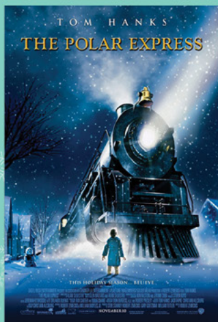
The Polar Express (2004) Dec. 14 & 15