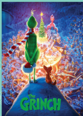
The Grinch (2018) Dec. 14 & 15

As a special gift to our members this holiday season, we're excited to invite you and your family to our complimentary holiday party! Celebrate the season with festive fun, including holiday-themed science programs, creative crafts, hot chocolate, and even a chance to snap pictures with Santa! Don't miss this magical event designed to spread holiday cheer and create lasting memories.